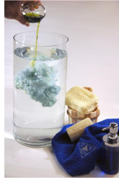
Oil bath formulation with „blooming effect“